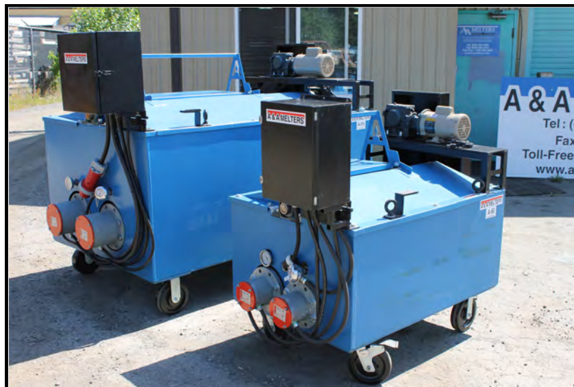
A-210 & A-60 Electric Melters