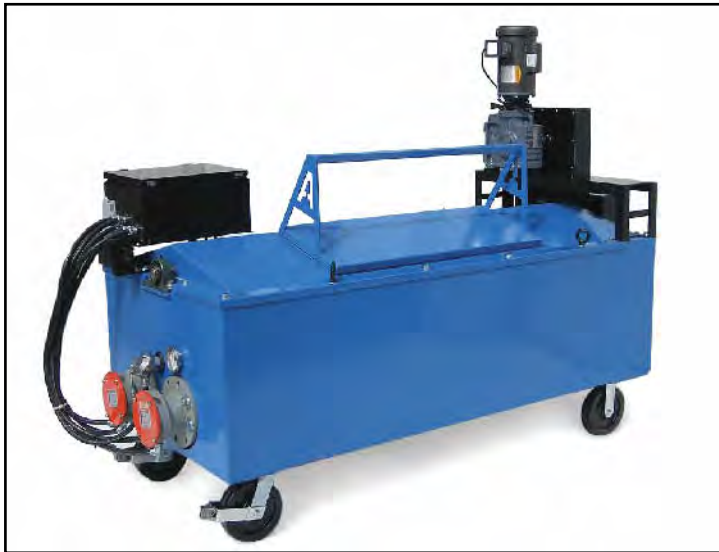
Model A-110 Shown

No more open flames on the rooftop! Our new Electric Melter Series of A&A Steel Melters are 100% electric with efficiency to match our well known standard of quality. All of our models come equipped with electric heater elements, an electric drive system for the agitator, and a factory programmed, easy to use temperature regulator and safety system.